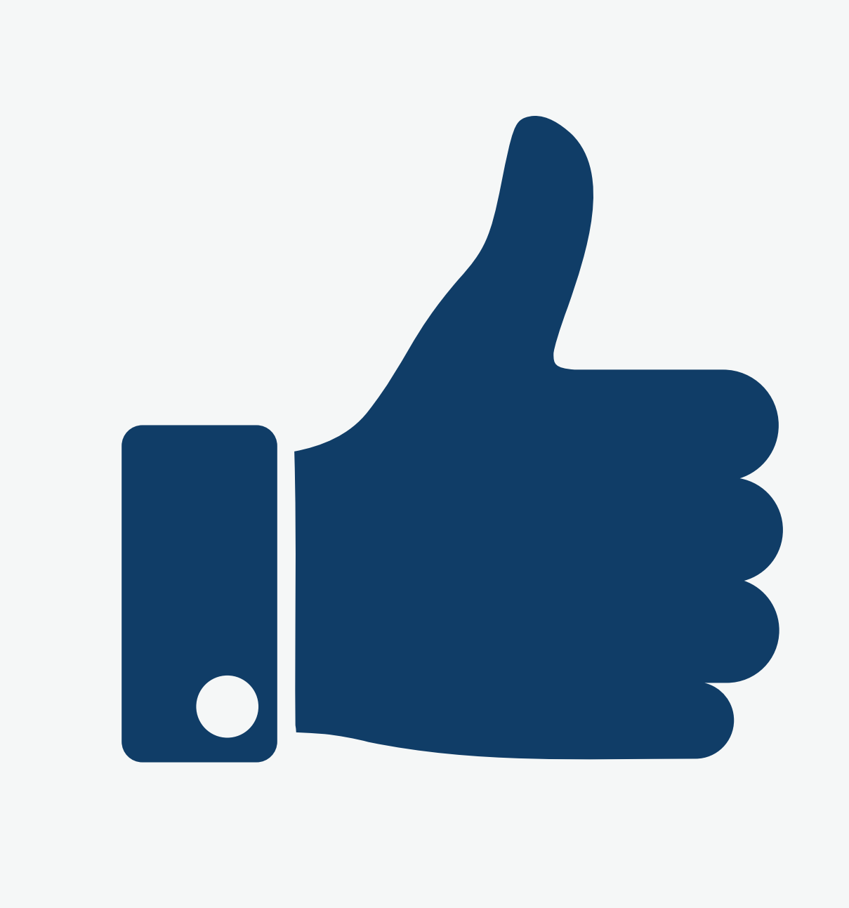
Get approved for an amount