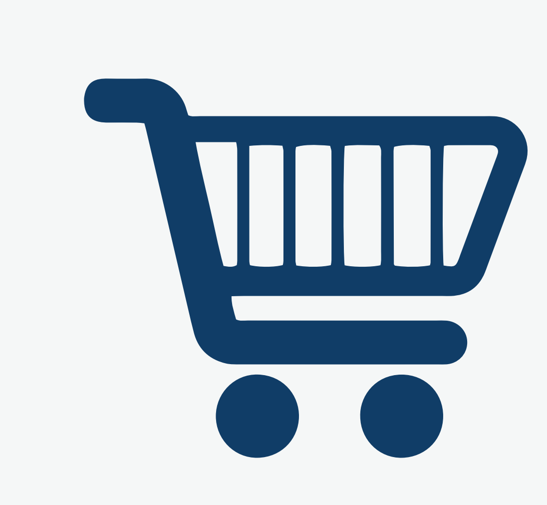
Choose your products online or instore